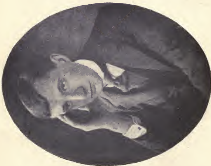
A. F. KERENSKY